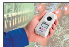
In the plant or in the field!