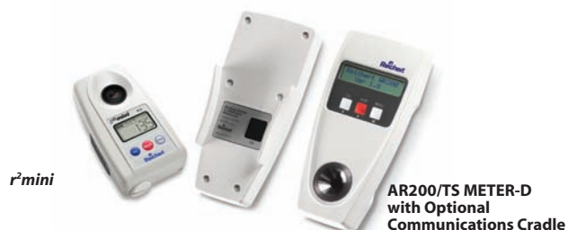
r 2 mini